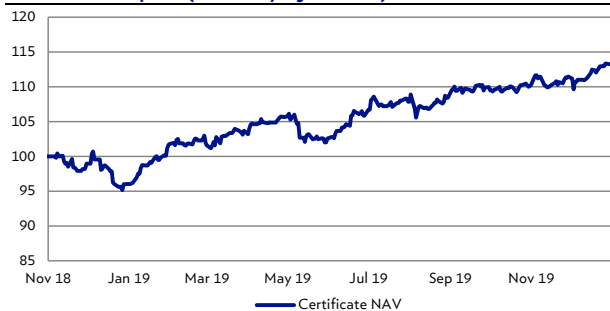
Chart Since Inception (vs Underlying Portfolio)